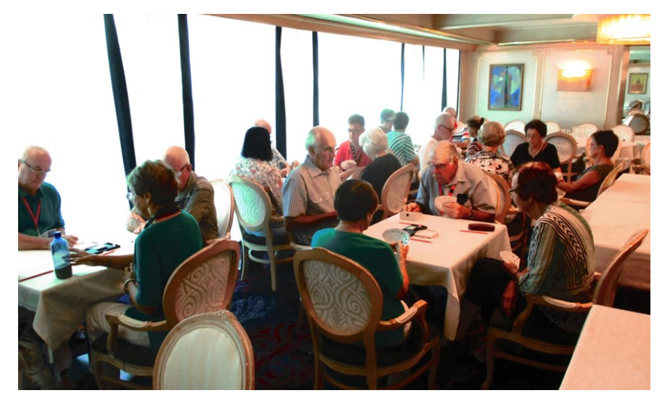
On occasion, passengers on the Voyager of the Seas joined members of the Ballina Bridge Club seen here enjoying their bridge.

small New Caledonian island, Maré Island. Missing out on Fiji was unfortunate as a lovo (food cooked under ground in baskets on heated stones, the same as the NZ Hāngi ) was