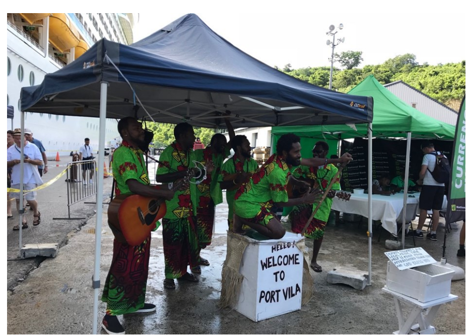
Despite the rain, the Port Vila band turned out to welcome passengers on the Voyager of the Seas.