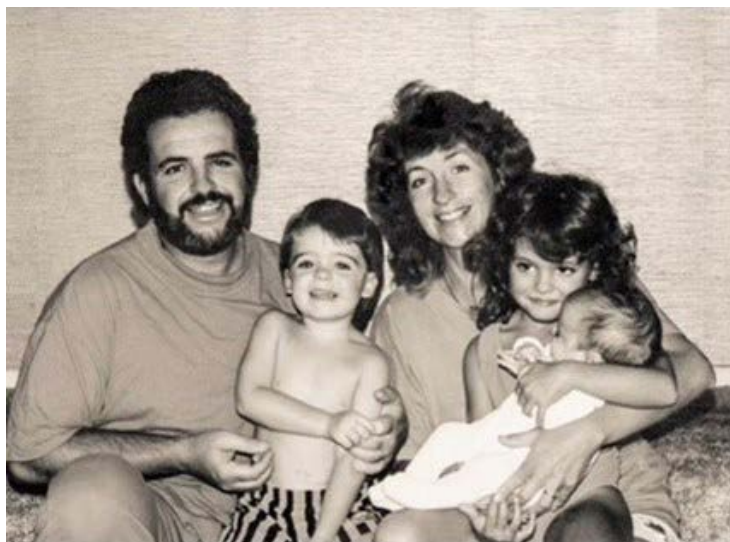
Family at another stage