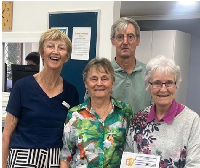
Winners at Coffs Harbour Teams Congress