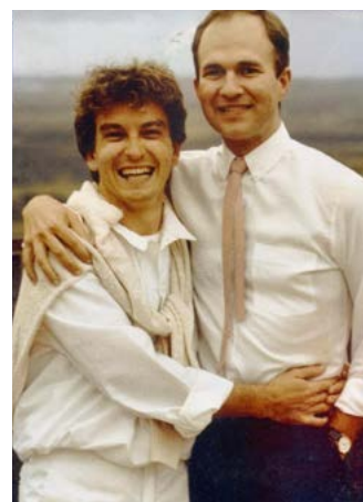
Wedding Day, October 17, 1984